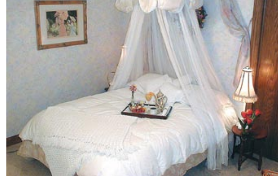
▲ The Orleans Room

While Serenity Bed & Breakfast Inn is perfect for the business traveler, it also offers outstanding lodging accommodations for couples, vacationers, reunions, or retreats. The Inn has an elegant, charming and quiet atmosphere with amenities